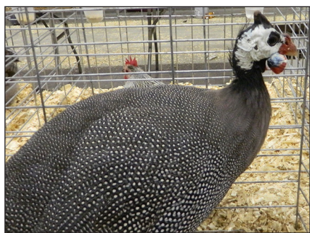
Figure 1. A pearl grey helmeted guinea hen. Jacquie Jacob

The remainder of this publication refers to raising the helmeted guinea fowl.