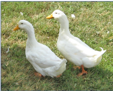
Figure 3. Female (left) and male (right) Pekin ducks. Jackie Jacob

The Pekin (Figure 3) is popular because of its fast growth rate and yellow skin. Pekins should not be raised past ten weeks of age or they will become extremely difficult to pluck because of pin feathers. Also, the feed efficiency declines sharply at this age. Pekins can be considered a general purpose breed since they also lay approximately 200 white eggs per year.