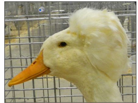
Figure 4. Crested duck. Jackie Jacob

breed. A Crested duck typically does not breed true. The gene responsible for the crest is lethal when there are two copies present. As a result, one-fourth of the fertile eggs will not hatch. Only two-thirds of the remaining fertile eggs will develop into ducks with crests. The other one-third will not have a crest and will not carry the gene necessary to produce a crest in further generations. Many raise the Crested duck for exhibition purposes only, but they do lay well, and their growth rate, though not as good as the heavy breeds, is good.