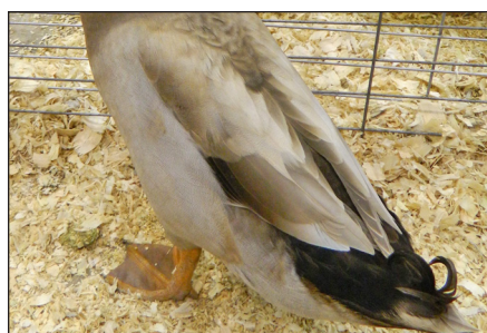
Figure 1. Male sex feathers on a duck. Jackie Jacob

The different breeds of ducks are believed to have originated from the wild Mallard ( Anas platyrhynchos ). The male Mallard has a couple of curled tail feathers referred to as the sex feathers (Figure 1). No other wild duck has these sex-feathers. All the males of the domesticated duck have the curled tail feathers as well.