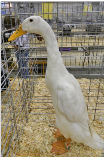
Figure 5. Female Runner duck. Jackie Jacob

Runners are good at foraging. They will eat worms and slugs and have even been seen to catch flies. Only the females quack. All drakes are limited to a hoarse whisper. Because of their small size, Runners eat less feed than meat ducks. Of course it is important to provide them with sufficient calcium and protein-rich food to maintain egg production during the extensive laying season. The darker varieties lay blue-tinted eggs.