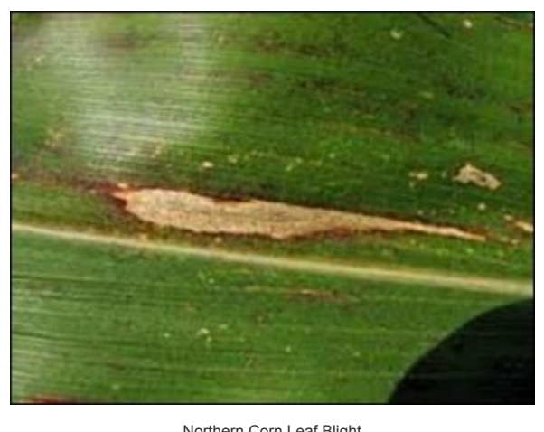
Northern Corn Leaf Blight

BMSB activity is extremely low. At present, no traps are catching more than one per night. Adult activity continues to be well behind previous years. As adult captures increase to 5/night for a full week, maps will be produced to show where activity is highest. Information on scouting, crop injury and control will also be included.