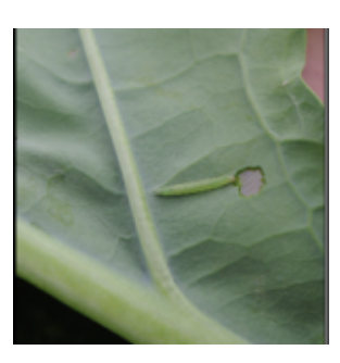
Diamondback Moth Larva Click Image to Enlarge

In parts of central NJ, new broccoli and collard plantings are developing crucifer downy mildew (CrDM) infections. CrDM caused necrotic spots to develop on the upper surface of older leaves. Inspection of the lower leaf surfaces will show pale purple sporulation (see photo at right) erupting from the infected tissue. This disease can be especially hard on broccoli and collard greens, so growers should actively scout plantings at least weekly. Cole crops should be treated with appropriate fungicides at the first occurrence of this disease. Consult the 2014 Commercial Vegetable Production Recommendations for specific fungicide recommendations.