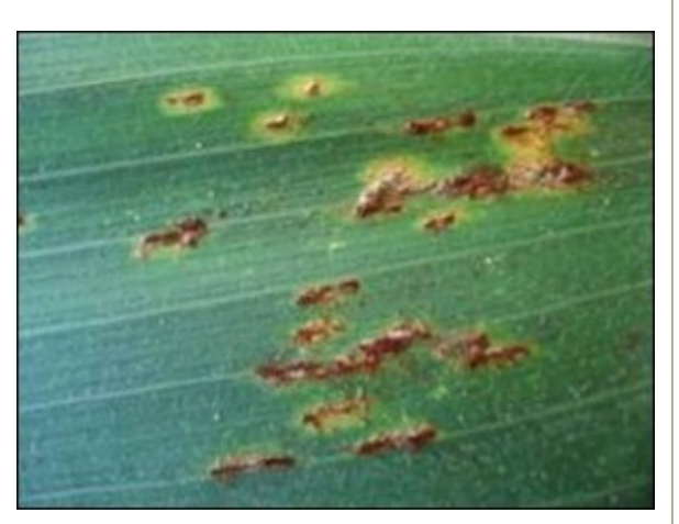
Corn Leaf Rust

Distribution of Adult CEW in Pheromone Traps for the Week Ending August 20, 2014 CEW Avg. Nightly Pheromone Trap Count 0 - 0.75 0.75 - 1.55 - 20 >20 20 Miles Data collected by Joe Mahar and processed by Kris Holmst Rutgers Cooperative Research and Extension Click Image to View