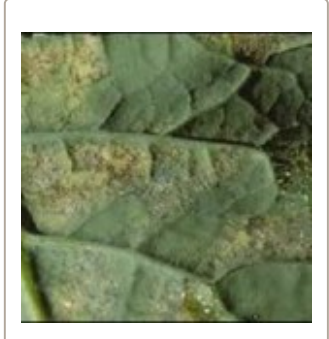
Crucifer Downy Mildew Click Image to Enlarge

All current and archived Vegetable IPM Maps including European corn borer, corn earworm and brown marmorated stink bug population maps are available for viewing @ http://tinyurl.com/njaes-ipm-maps